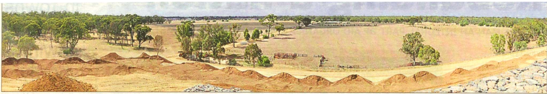
Panoramic: The view from the new mountain bike lookout at Kialla.